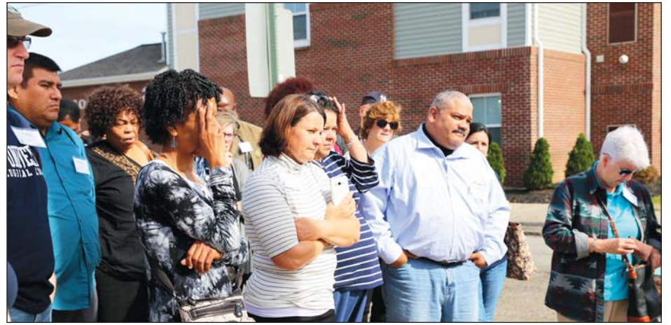
36 laity and clergy from GNJ took a road trip on a charter bus from New Jersey to Ohio to attend the 'All People Conference.' The group stands together on a south Columbus street corner, learning about affordable housing initiatives and the ministries of the All People Church.