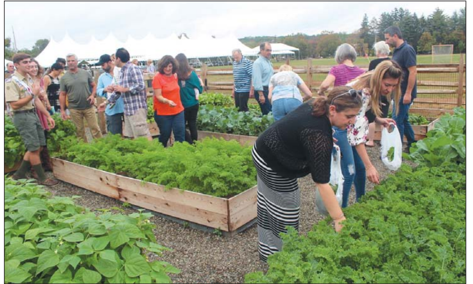
Franklin Lakes UMC has partnered with the Borough of Franklin Lakes and its Environmental Commission to build a community garden on town property. A garden next to the church has faithfully grown vegetables for the CUMAC food pantry in Paterson for the last six years.

The garden was constructed by a Boy Scout in late July for his Eagle Scout