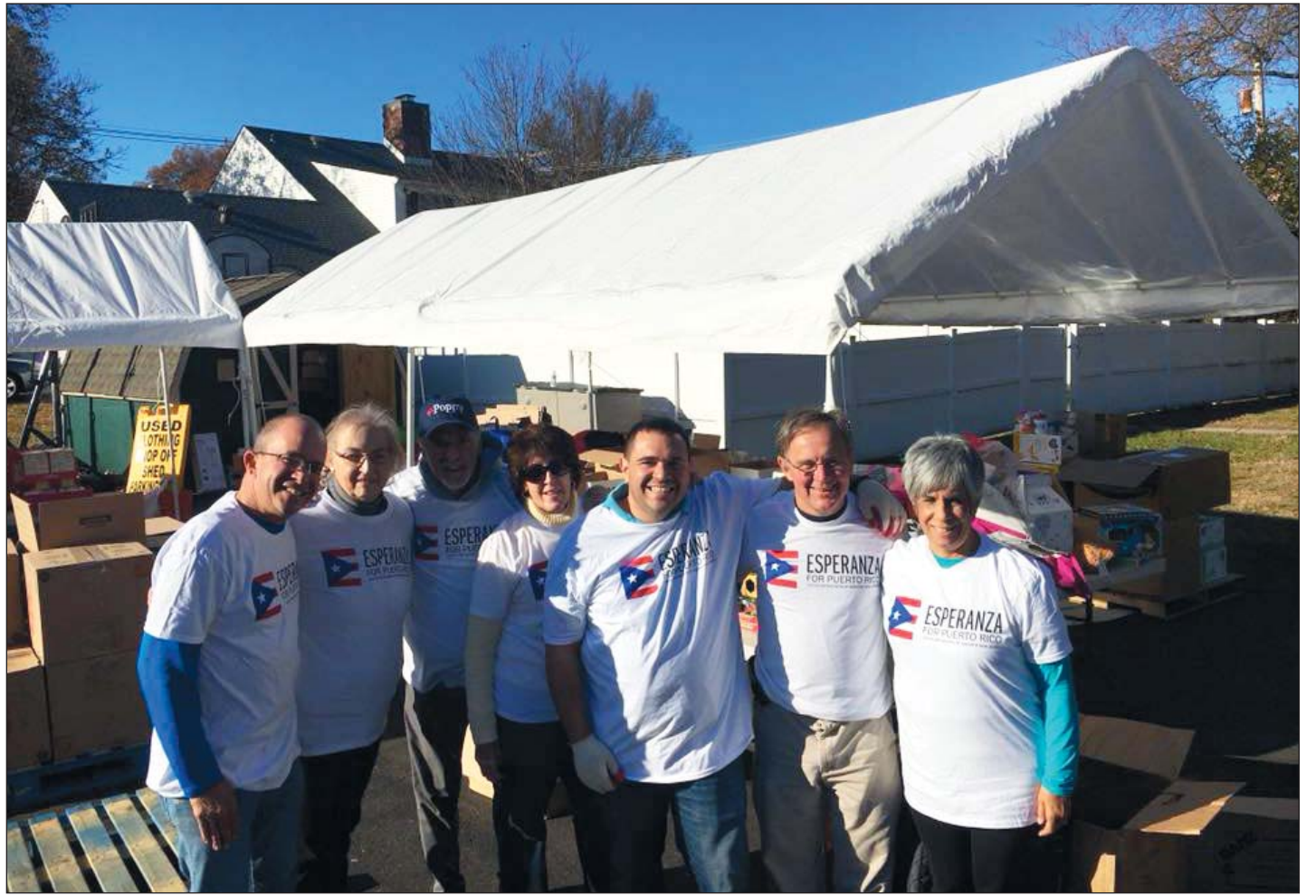
A Food, fund and supply drive was held as a part of a Service of Thanksgiving on Nov. 19 at First UMC of Hightstown. $50,000 was raised for Hurricane Maria ravaged Puerto Rico, 27 pallets of food, and six pallets of Christmas toys were gathered for shipment to the island.