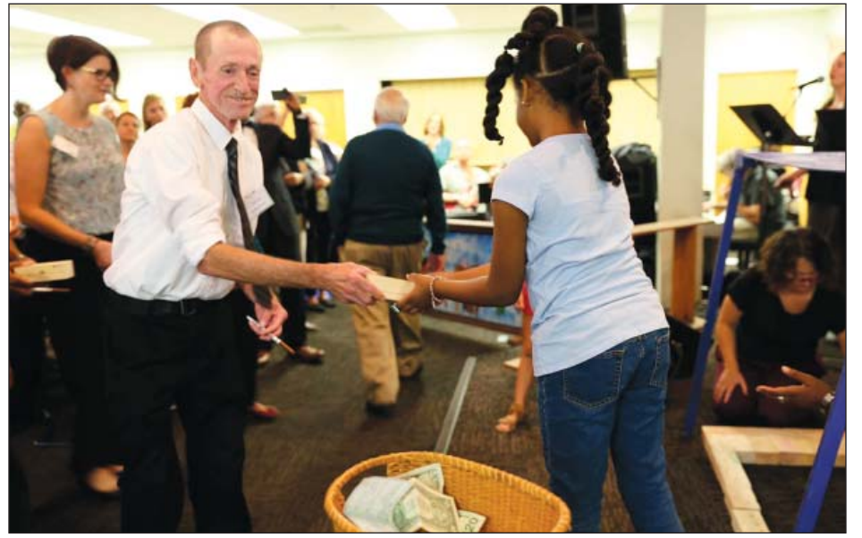
'Rise up and Build' was the theme of the 2017 'All People Conference' in Columbus, OH. Participants were given wood blocks to write their hopes, dreams, and ministry ideas to present at the altar.

'Rise up and Build' was the theme of the conference which was exemplified