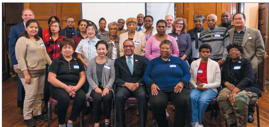
"The Mission Movers" - Six United Methodist communities in Jersey City have come together in ministry together to serve their city.