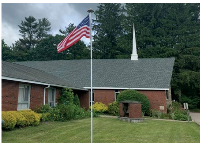
The Angels Community Thrift Shop (ACTS) at the UMC at Newfoundland reopened its doors on June 27.

For more information about PaCE, visit www.gnjumc.org/pace/ .