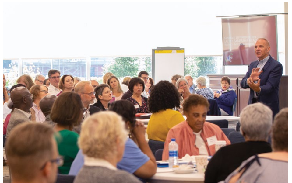
This year’s Leadership Academy will be open to both clergy and laity starting this October.

Exploring the dynamics of sharing, learning, prayer and action, this program scheduled for three Thursday evenings in January 2021 will focus on unique