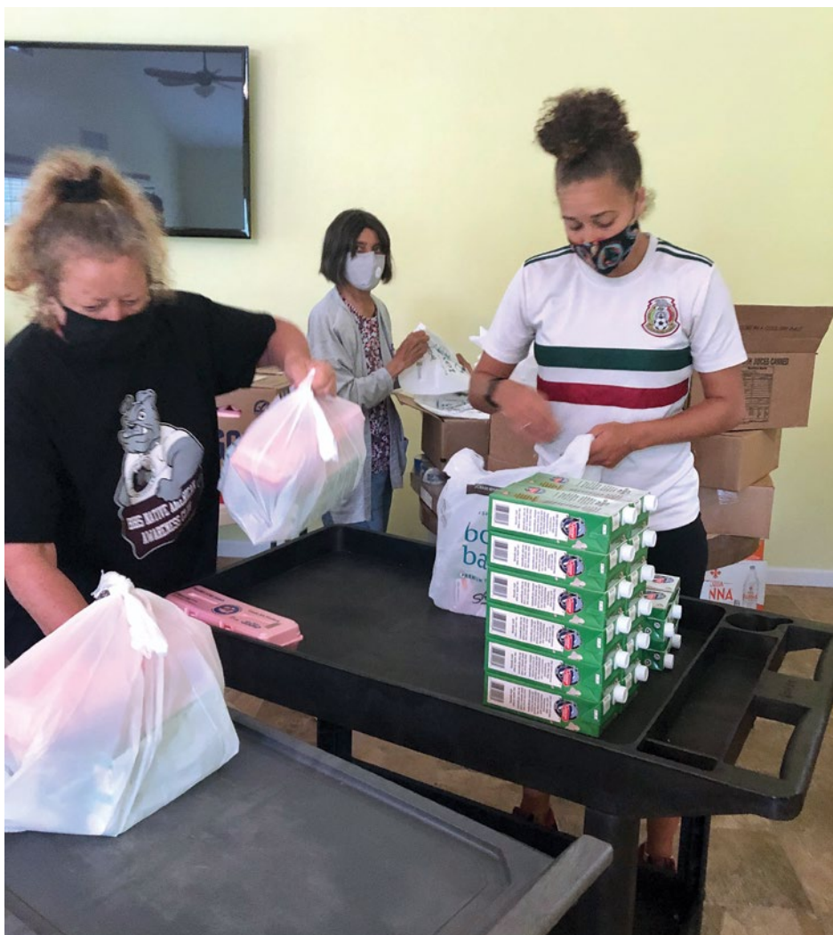
St. John’s volunteers pack the more than 200 boxes required to meet the demand at their food pantry.