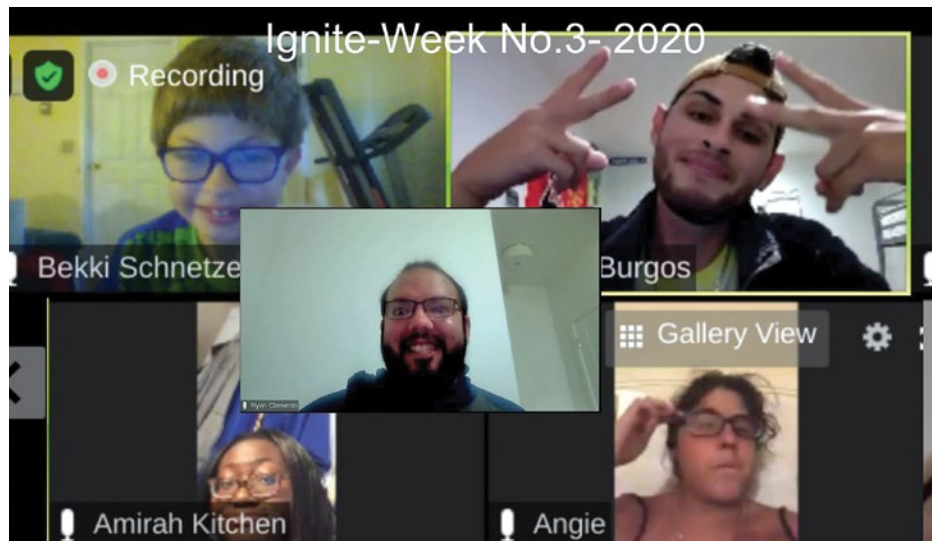
Next Gen’s newly-developed Summer at Home was a departure from the traditional summer camp with new additions like a scavenger hunt and exploring different music genres.