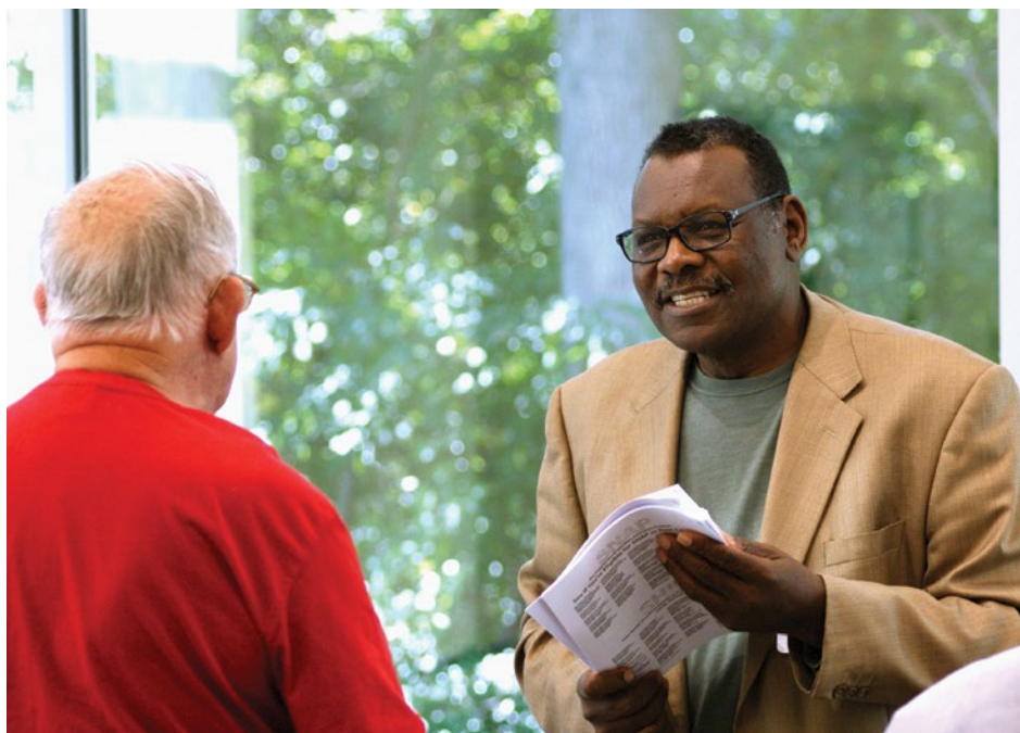
The new program will offer four different free webinar series from October to February to provide an engaging remote learning experience.