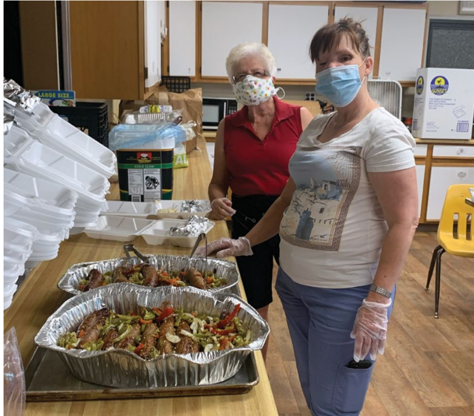
Chews UMC volunteers prepare meals for the hungry in Glendora and then distribute the boxed meals via a drive-up.

Using a drive-up design to maximize safety, they provide boxes of non-perishables, eggs, milk, butter, produce, fresh meat as well as hot meal to go for everyone in line.