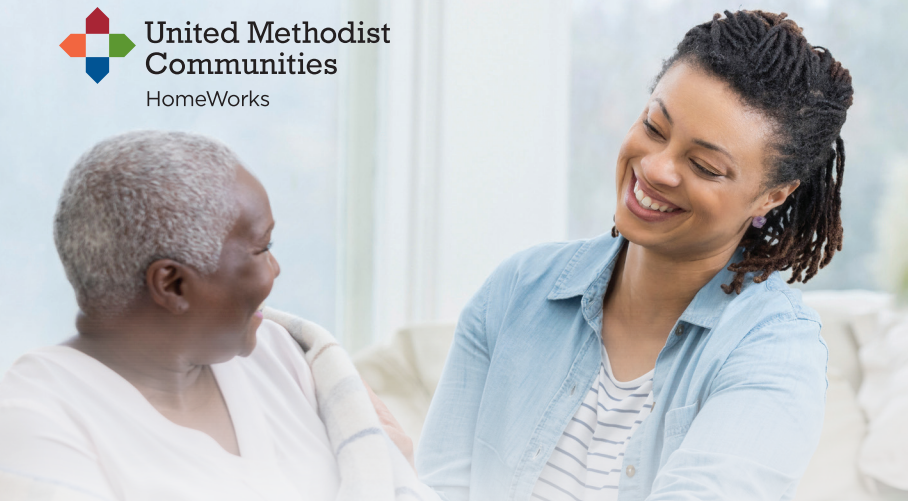
Chart Your Own Future

Are you seeking a rewarding, meaningful career to fit around your lifestyle? One that requires no major commitment and allows you to start and stop? Do you enjoy the company of older adults?